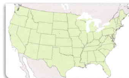
US coverage includes the 48 contiguous states