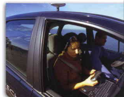
Top – NAVTEQ TRAFFIC delivers flow, incident and construction data.