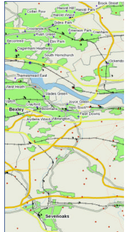
London Boroughs, Europe